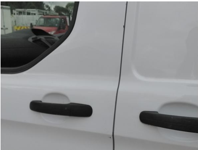
5: Door nsf Chipped Edge Chip