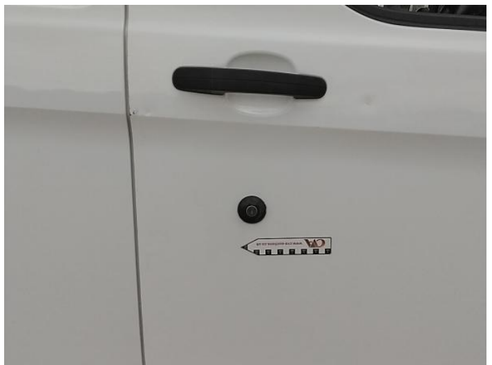
14: Door osf Dented 2 Or Less UpTo 10mm