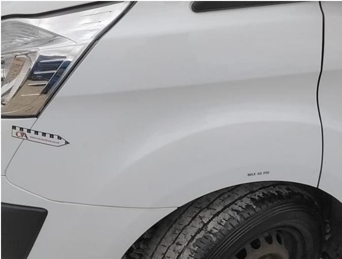
3: Wing nsf Chipped 1 To 5