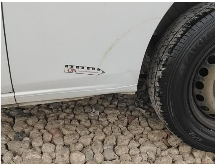
7: Qtr Panel nsr Dented Over 2 UpTo 10mm