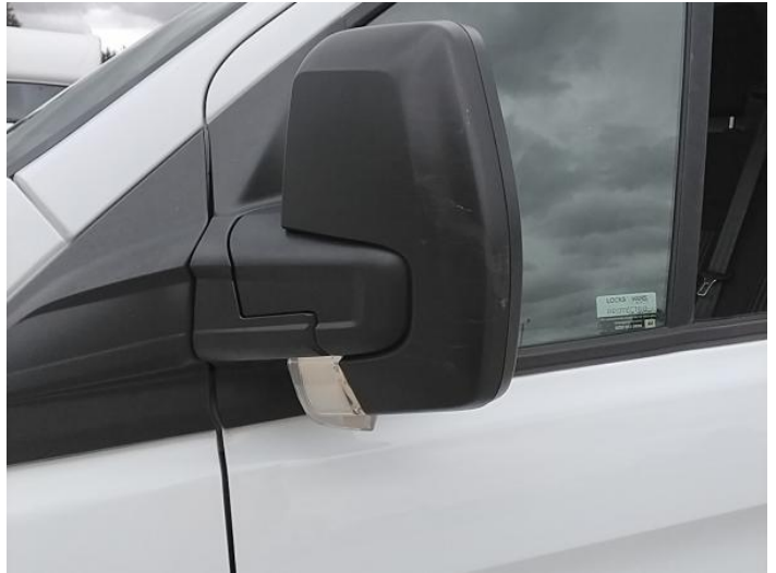
4: Door Mirror Assy nsf Scuffed (Unpainted) UpTo 100mm