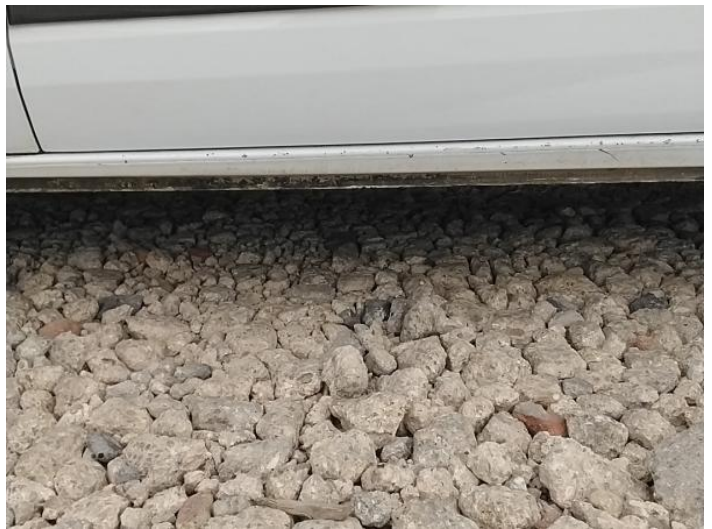
6: Sill ns Chipped Multiple Chips