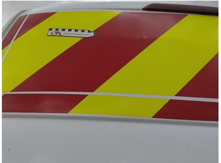
10: Door nsr Dented Over 30mm