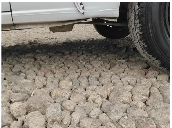
8: Sill ns Dented Over 30mm