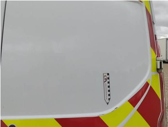
9: Door osr Scratched UpTo 25mm Thru Paint