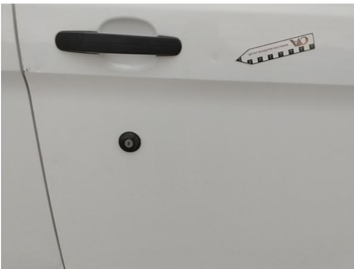
13: Door osf Dented With Paint Damage