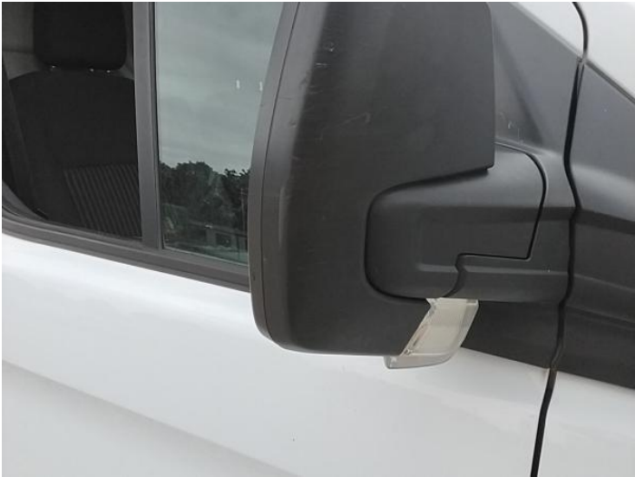
15: Door Mirror Assy osf Scuffed (Unpainted) UpTo 100mm