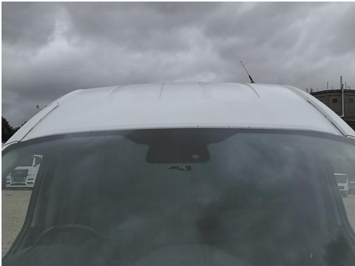
2: Other N/A N/A