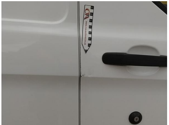
12: Door osf Dented Over 2 UpTo 10mm